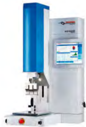
Manual work station