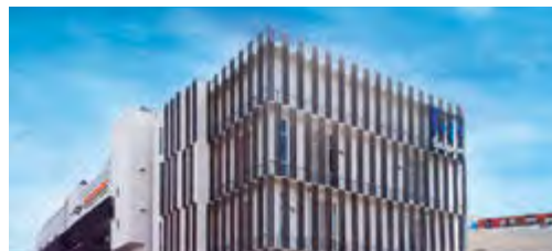
Japan Headquarters Herrmann Ultrasonic Japan Corporation KOIL 503-1, 148-2 Kashiwanoha Campus, 178-4 Wakashiba, Kashiwa City, Chiba 277-8519 · www.herrmannultrasonic.co.jp