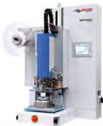
Punch &amp; seal machine