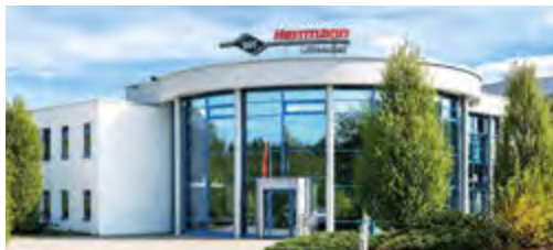
Global Headquarters Herrmann Ultraschalltechnik GmbH & Co. KG Descosstraße 3–9 · 76307 Karlsbad, Germany www.herrmannultraschall.com