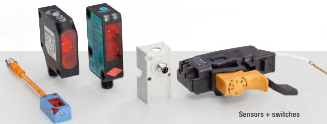
Sensors + switches