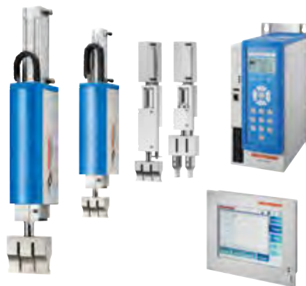
Ultrasonic welding systems