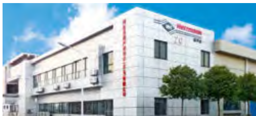
China Headquarters Herrmann Ultrasonics (Taicang) Co. Ltd. Build 20-B, No. 111, North Dongting Road, Taicang, Jiangsu Province, China · www.herrmannchina.com