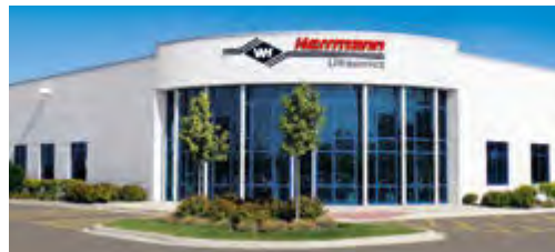
North American Headquarters Herrmann Ultrasonics, Inc. 1261 Hardt Circle · Bartlett, IL 60103, USA www.herrmannultrasonics.com