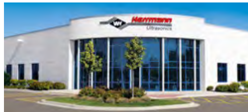
North American Headquarters Herrmann Ultrasonics, Inc. 1261 Hardt Circle · Bartlett, IL 60103, USA www.herrmannultrasonics.com