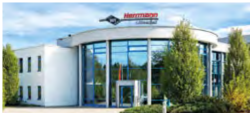
Global Headquarters Herrmann Ultraschalltechnik GmbH & Co. KG Descosstraße 3–9 · 76307 Karlsbad, Germany www.herrmannultraschall.com