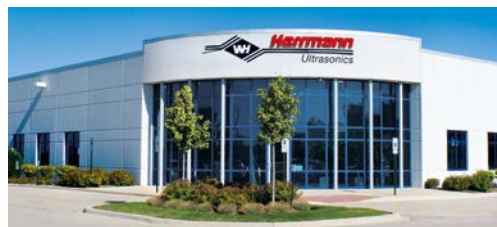
North America Headquarters Herrmann Ultrasonics, Inc. 1261 Hardt Circle · Bartlett, IL 60103, USA www.herrmannultrasonics.com