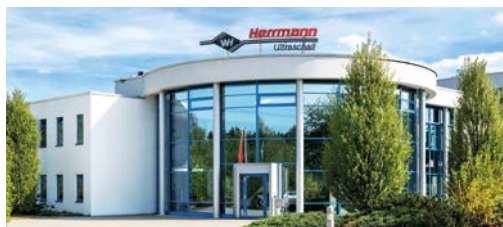
Global Headquarters Herrmann Ultraschalltechnik GmbH & Co. KG Descostaße 3-11 · 76307 Karlsbad, Germany www.herrmannultraschall.com

FIRST CLASS TECHNOLOGY. WORLDWIDE. 24 LOCATIONS IN 18 COUNTRIES.