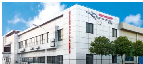
China Headquarters Herrmann Ultrasonics (Taicang) Co. Ltd. Build 20-B, No. 111, North Dongting Road, Taicang, Jiangsu Province, China · www.herrmannultrasonic.cn