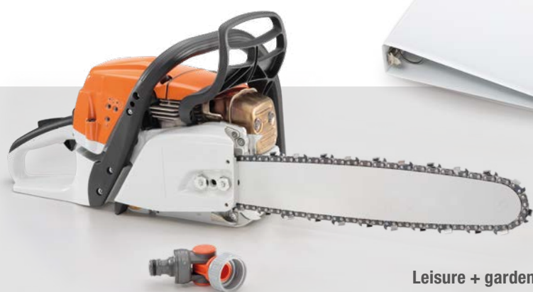
Leisure + garden