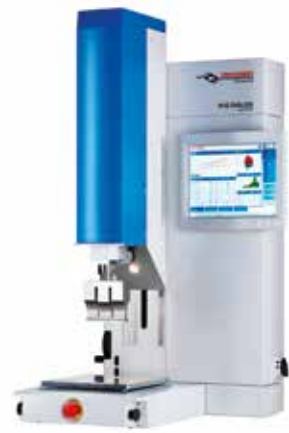
Bench top welder