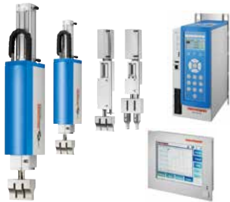
Ultrasonic Welding Systems