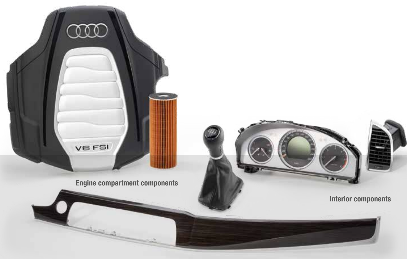
Engine compartment components