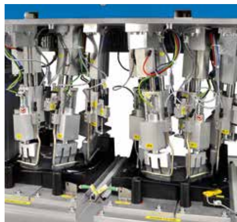
Solutions for machine builders